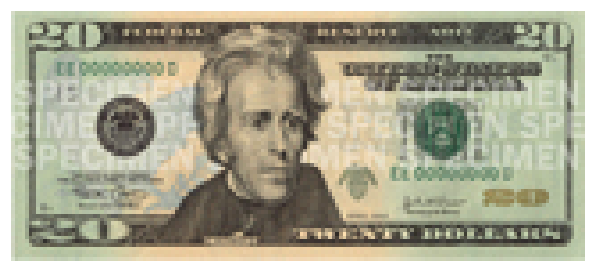
$20.00 Note (Common)