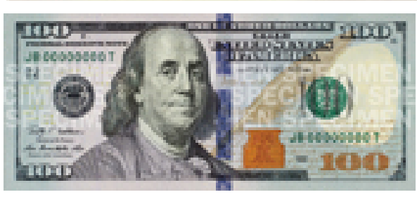
$100.00 Note (Common)