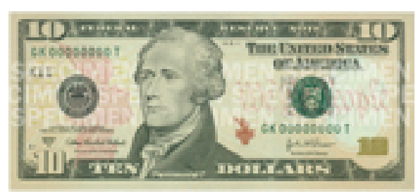
$10.00 Note (Common)