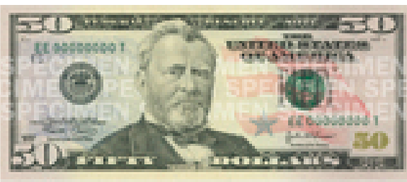
$50.00 Note (Common)