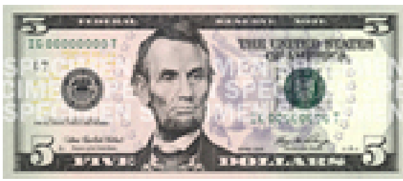
$5.00 Note (Common)